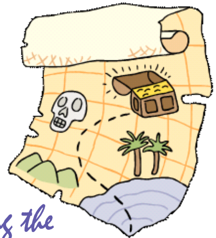
Seeking the Treasures of Nebraska